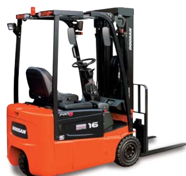
B13R-5 / B15R-5 / B16R-5 1,250kg to 1,600kg Capacity 24VOLT Pneumatic & Solid Tire